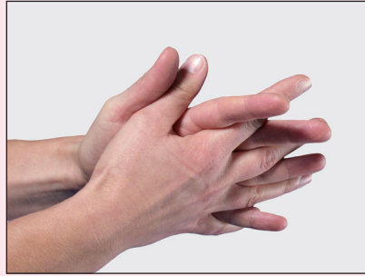
2. Palm on palm with spread and interlocked fingers