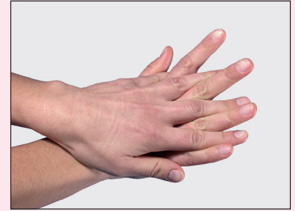
3. Palm on back of the other hand with spread and interlocked fingers