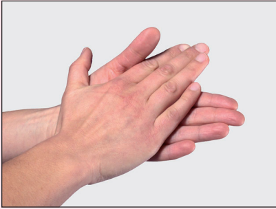
1. Palm on palm