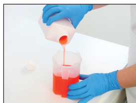
Pour the new GREEN&CLEAN M2 into the container (500 ml)