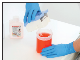
Reattach pump head on the container by turning it clockwise, and put dosing unit back into the dispenser