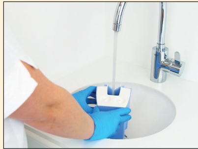
2. Fill container with cold water up to the indicator (= 600 ml of 1% dilution)