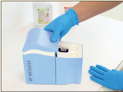
1. Press dispenser pump twice (= 6 ml of concentrate)