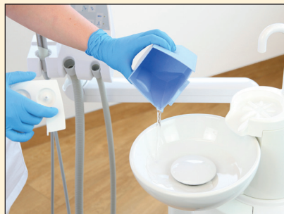
5. Empty the remaining solution into the cuspidor (200 ml)