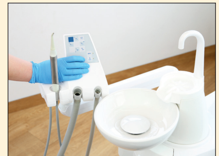
6. Observe action time and then rinse (HBV/HIV/HCV: 60 min, tuberculocide: 240 min)