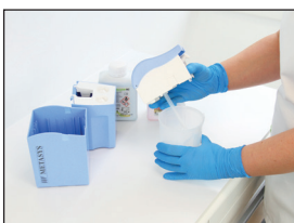
Remove the dosing unit from the dispenser and remove pump head by turning it counter-clockwise