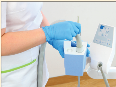
4. Hold large suction tube on opening no. 2 until air is sucked in (200 ml)